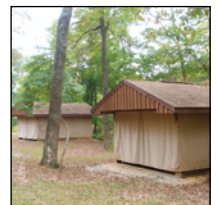
Shelters sleep up to 32.

Tent Sites are available at four pavilions across the road from the main compound for groups from five to 500. Groups must provide their own equipment and provisions.