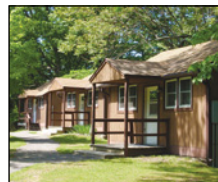
Cabins sleep 8 each.

Covenant House offers groups up to 20 a two-story retreat building with bedrooms and community baths on both levels. A large meeting area and snack area are located on the first level.