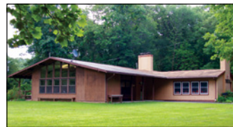
Friendship Hall provides dining facilities.

Cabins offer space for up to 32 people. Each cabin sleeps eight in two rooms with bunk beds. The Meeting House provides a spacious meeting area as well as bathroom and shower facilities for these units.